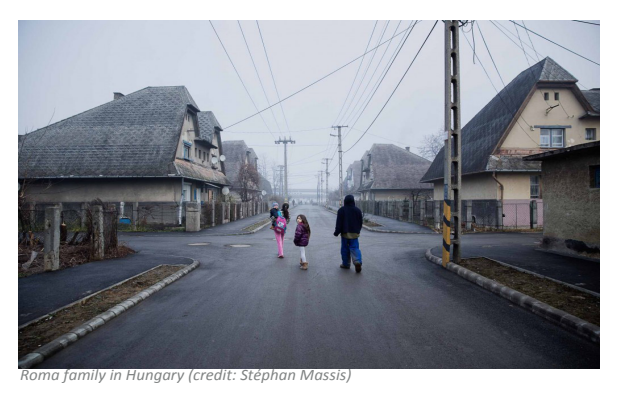
In your opinion, what would be a welcome development in the European framework? How can we work with the countries of origin?

In France, since the transitional measures were lifted, the circular was implemented in 2012 and DIHAL's involvement, comprehensive local support projects, which focus on migrants' access to common rights, are emerging over time. These projects could serve as a reference model for the European framework. By focusing on concerns regarding poor housing and economic instability, rather than cultural or 'ethnic' issues.