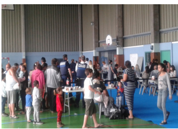
Welcome and directing people to facilities on orientation day

It is the fifth joint operation of this kind which has been carried out in urban areas in Toulouse. In total, 931 people have been taken care of over four years.