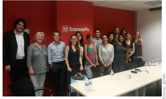
Seminar at Sciences Po with Harvard students

slums and illegal settlements in France as well as to introduce organizations actively working to address this issue.