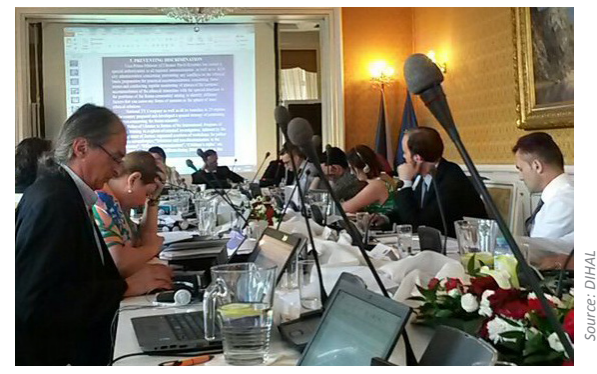
CAHROM meeting in Prague

of Roma populations in general. Several countries, notably Spain, Italy and Great Britain, gave a favourable response to the importance of the transnational outlook on this subject. The next CAHROM meeting will be held in Strasbourg from 24 to 27 October.