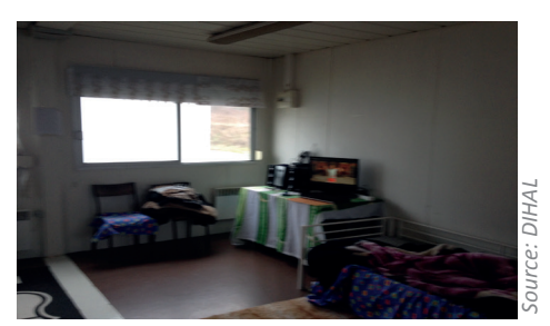
Modular housing at the Ris-Orangis living quarters

On 25 January, DIHAL visited the Ris-Orangis living quarters in Essonne, which has been able to welcome around 25 families from slums since 2013, offering them temporary modular housing and sustainable social support. This project, led by the Le Rocheton association, has a very high positive exit rate (all families have managed to access housing after eighteen months and obtain sustainable employment). In June 2016, the action was renewed for the third consecutive year. The project aims to be fully integrated within the framework of the regional strategy for slum clearance in Ile-de-France, in support of the Welcome, Information, Guidance and Follow-up (AIOS) platform. One of the key